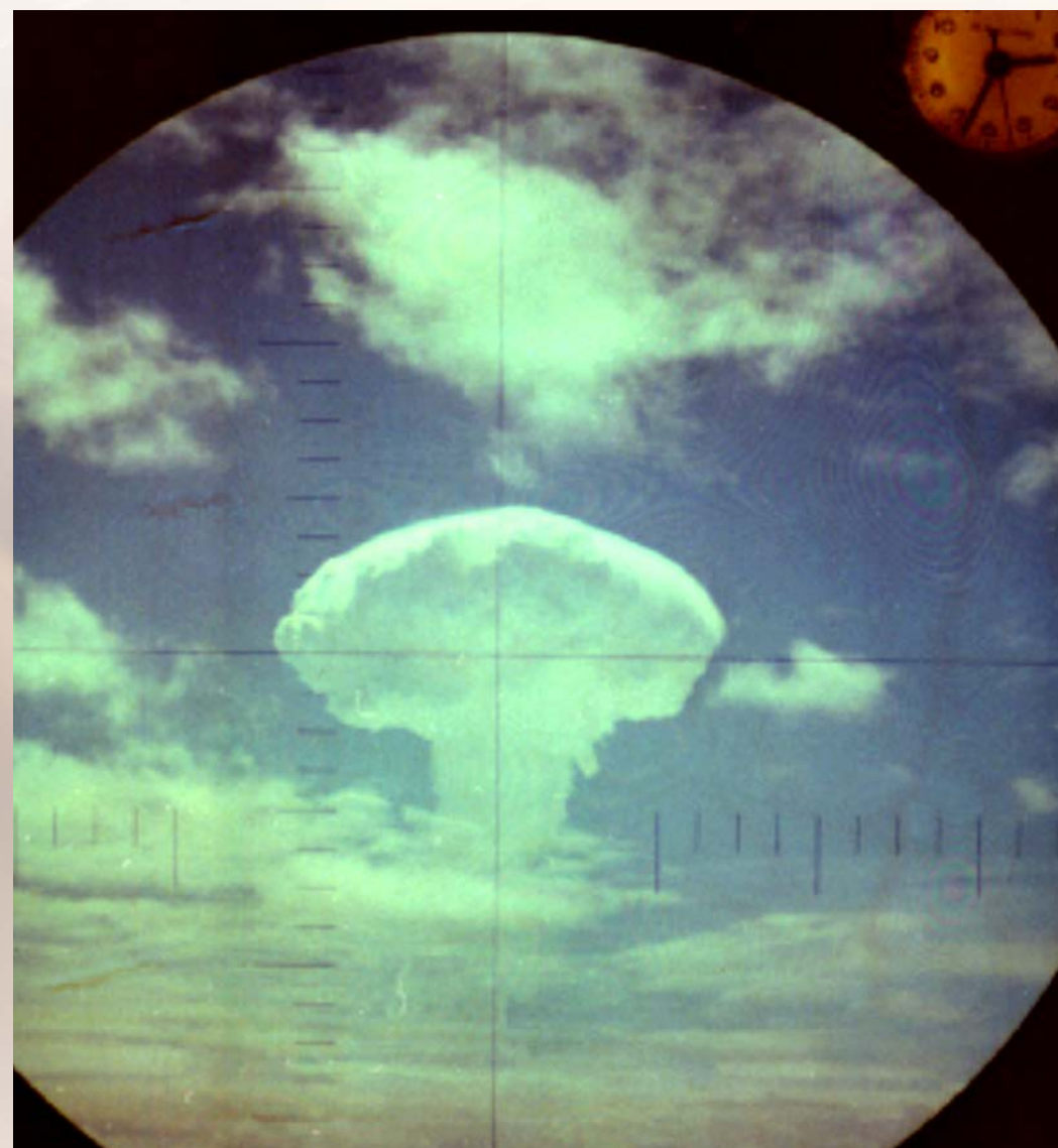
The mushroom cloud from the Frigate Bird operational test of the Polaris missile and warhead was observed through the periscope of the USS Carbonero , which was stationed some 30 miles from ground zero.

to study cratering effects. The collected data also helped to validate later fallout models developed at the Laboratory.