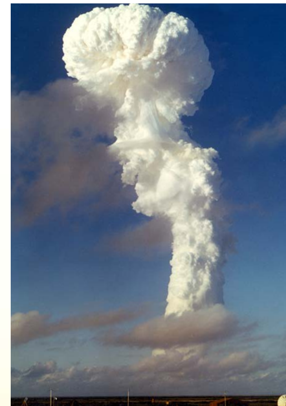
For Livermore's Muskegon test in Operation Dominic, the nuclear device was air-dropped from a B-52 bomber near Christmas Island. The yield of the weapons-related experiment was in the range of 50 kilotons.

Experiments were also carried out in 1962 to gather weapons effects data for the Department of Defense (DOD). For Operation Fishbowl (part of Operation Dominic), five Los Alamos-designed devices were lofted by Sandia-designed rockets and detonated at high altitude. Starfish Prime, for example, was a 1.4-megaton explosion at 400-kilometers altitude. Information was collected about the electromagnetic pulse phenomenon as well as other data related to ballistic missile defense systems (see Year 1966). Later in the year, additional tests for DOD were performed at the Nevada Test Site. In Johnnie Boy and Danny Boy, Livermore-designed devices were used