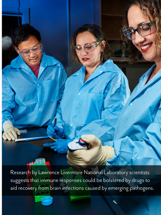
Research by Lawrence Livermore National Laboratory scientists suggests that immune responses could be bolstered by drugs to aid recovery from brain infections caused by emerging pathogens.